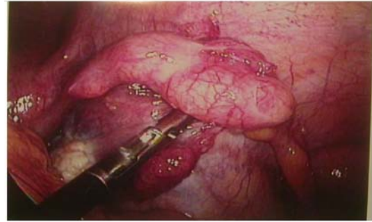
Figure 2: Right Adnexae adhered to anterior abdominal wall.